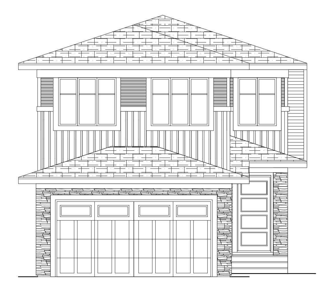
FRONT ELEVATION - 2559 sq. ft.