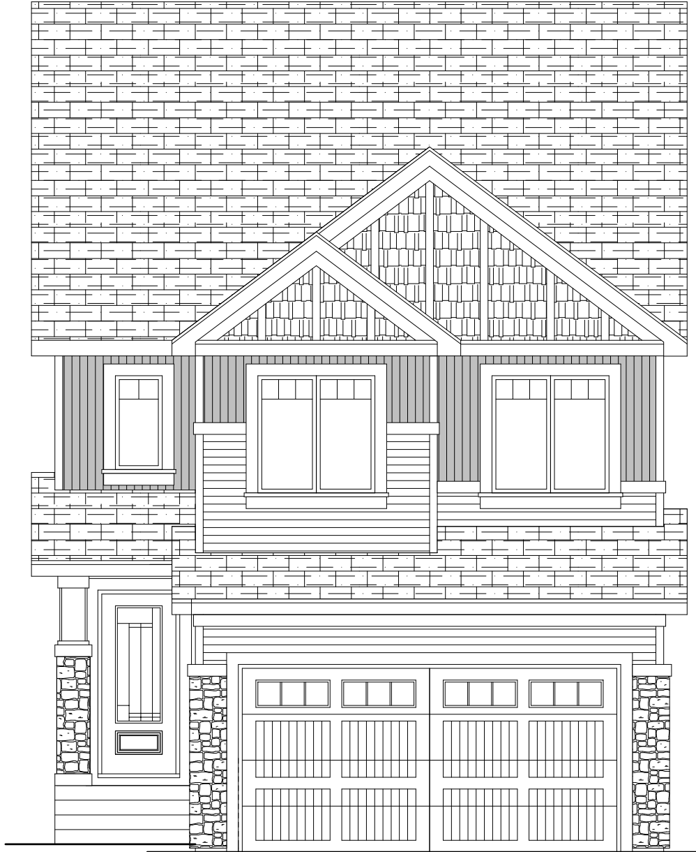
FRONT ELEVATION - 2255 sq. ft.