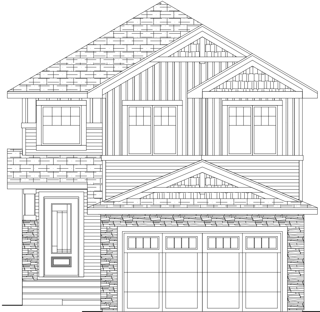
FRONT ELEVATION - 2257 sq. ft.