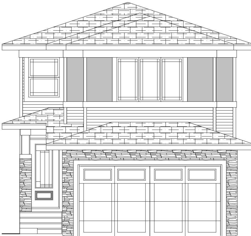
FRONT ELEVATION - 1813 sq. ft.